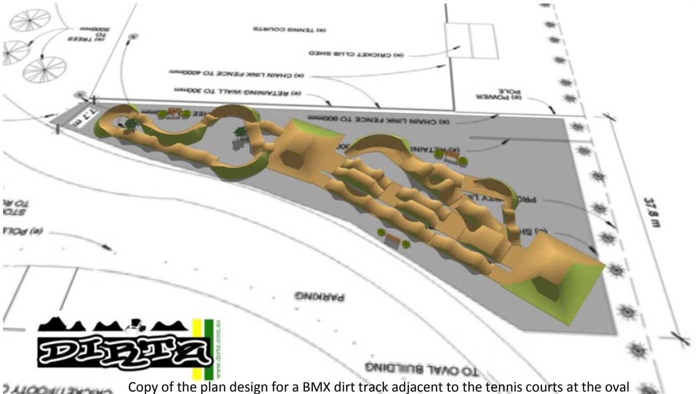
Copy of the plan design for a BMX dirt track adjacent to the tennis courts at the oval

Over recent months the Conditions of Hire for both the Oval and the Hall have been revamped taking into consideration the requirements for public liability and the requirements of our lease which is currently being reviewed with Council. Other annual leases with community bodies also have to be reviewed and will be done shortly. This will more adequately identify the requirement of lessees to be adequately insured.