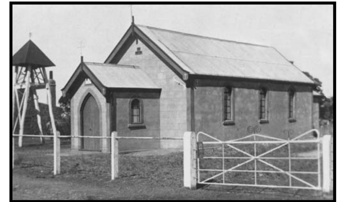
St John's Lutheran Church, Dutton, Built 1871. (Photo c. 1900)

Length: 31.5 km Driving Time: approx 50 min