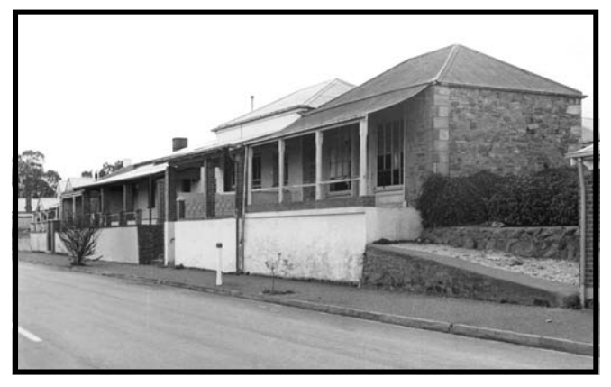
"High Homes", Moorundie Street, built c. 1850's (Photo 1976)

Further information available in the book: "Truro The Travellers Rest" by Reg Munchenberg Telephone 8564 0344