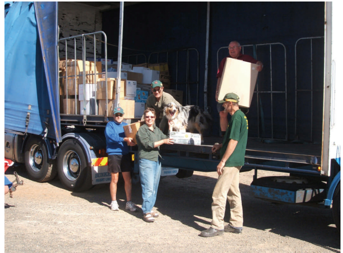
CFS Volunteers help load the truck to go to Melbourne

It is an exciting time for all schools and we are hoping to see the results within a 12 month period.