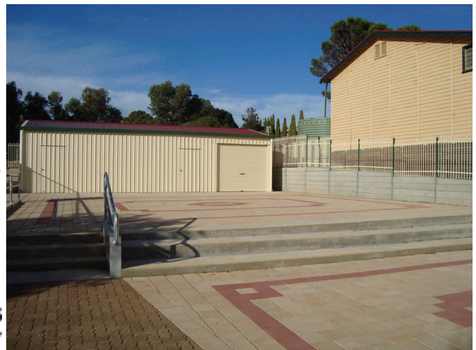
The Proposed area for a permanent shade structure at the Truro Primary School