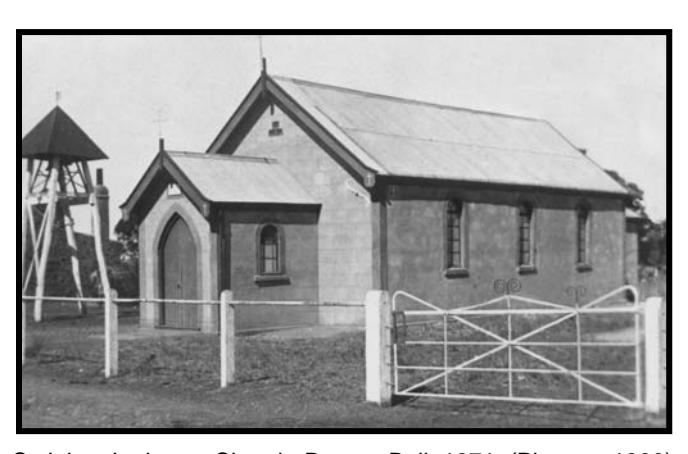
St Johns Lutheran Church, Dutton, Built 1871. (Photo c. 1900)

Length: 31.5 km Driving Time: approx 50 min