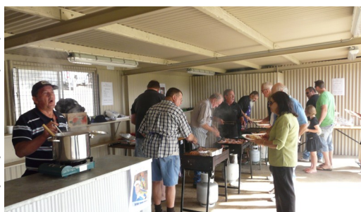
Many volunteers cooking the breakfast