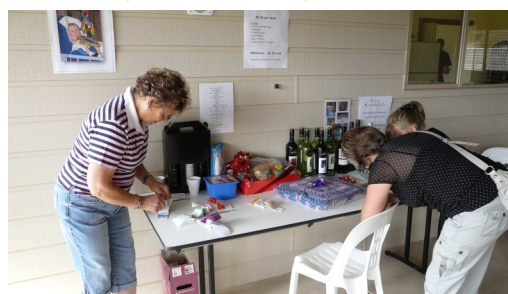
Trading table and Raffle Sales