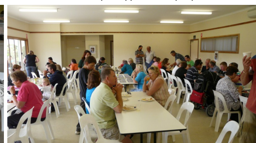
Seated for Breakfast