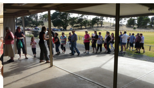
Part of the line-up of approx. 180 people served.