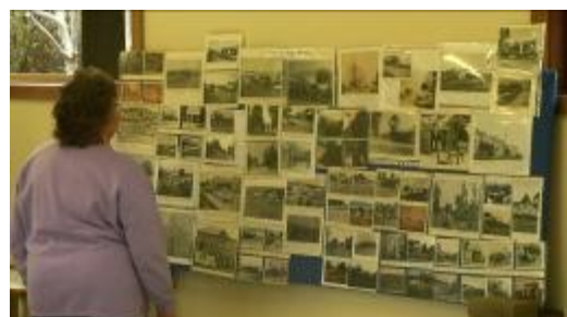
The Historical Photo Display