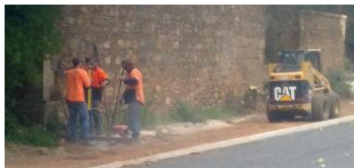
Council works staff commencing the installation of the fencing

The park has now been opened for vehicle access with the fence completed. The S41 Truro Projects Advisory Committee has not met recently due to caretaker provisions prior to Council elections. At the December Council meeting appointments will be made to committees, It is hoped to be able to obtain grant funding to further develop the site this financial year.