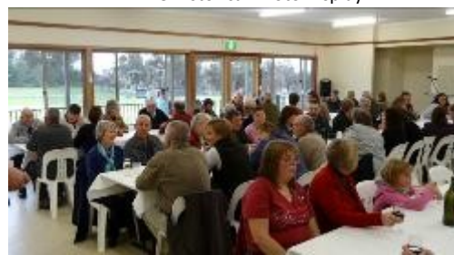
Invited guests seated for luncheon