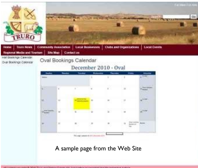
A sample page from the Web Site

Also a form for hiring can be downloaded as well as the terms and conditions of hire. Clicking on the 'Facilities to Hire' link on the home page will take you directly to the page. http://Truro.sa.au/clubs-and-organizations/facilities-for-hire