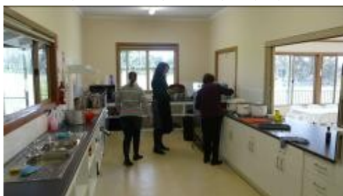
Luncheon being prepared in the new kitchen